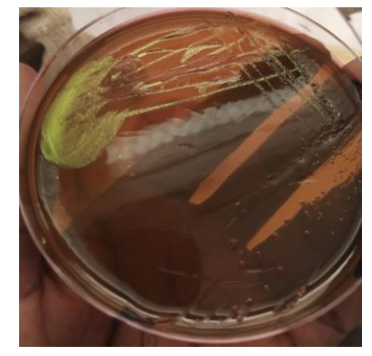
Plate III : Growth of E. coli indicated by green metallic sheen in Eoisin Methylene Blue

Plate II : Gram stain showing Gram +ve cocci in clusters and purple colouration indicative of Staph spp