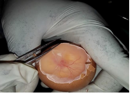
Plate II: Egg yolk preparation for further incubation and inoculation Incubated hen eggs showing vascularised yolk sac membrane with a normal blood circulation

obtained from mouse inoculation and that of embryonated eggs. Depass (1989) reported an excellent agreement in the LD50 of toxins using the conventional method and the up-and-down method. The three methods used produced values of LD<sub>50</sub> that were within the range reported by the Australian Venom and Toxin database and the Swiss Toxins database (SwissProt/TrEMBL, 2014). Based on the results obtained from this study, we concluded that the determination of the median lethal dose of the venom of Bitis arietans can be achieved using the conventional, up and down and embryonated eggs methods. Results obtained from the three methods used had no significant difference (p<0.05). The use of embryonated