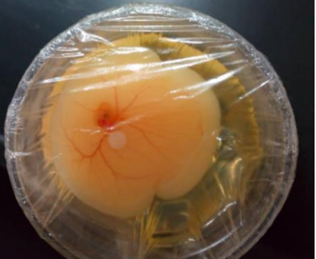
Plate III : Egg yolk in artificial shell for further incubation and inoculation The exposed vitelline vein in an artificial shell for monitoring embryonic death

Table 1 : Results for median lethal dose (LD<sub>50</sub>) for the venom of Bitis arietans using the conventional probit, up and down, and embryonated eggs methods respectively