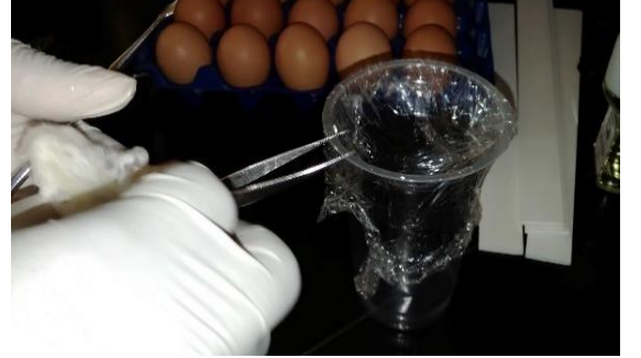
Plate I : Preparation of the artificial shell after the first 4 days of incubation

eggs (Table 1), this was within the range of other previously reported works on the LD<sub>50</sub> of Bitis arietans venom of 0.2 - 2.0 mg/kg (Mallow et al. , 2003; Anon, 2007) There was no significant difference (p≤0.05) in the LD<sub>50</sub> of the venom of Bitis arietans that was obtained by the up and down method and by the conventional probit analysis (p≤0.05; r = 1.00) (0.325 mg/kg [probit] and 0.351 mg/kg [up and down]