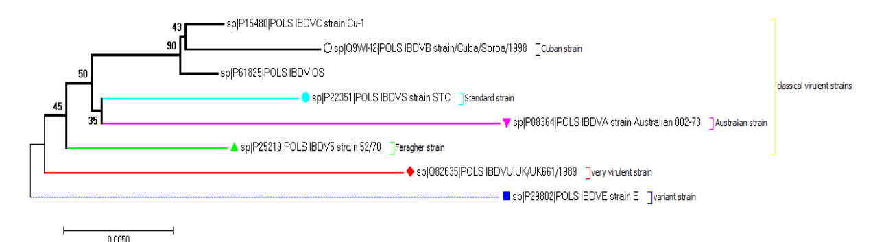
Figure 2: Evolutionary relationships of taxa

Europe, Asia and Africa, and their ability to cross high levels of protective antibody raised against the caIBDV strains in vaccinated flocks, the need to expound more on the current knowledge on the immune response to IBDV became apparent. The first isolation of variant strains were from chicken flocks with neutralizing Abs to serotype 1 strains of IBDV (Rodriguez-Chavez et al. , 2002) and both live attenuated and killed vaccines developed using variant strains conferred protection to challenged chickens with either classical or variant strains,