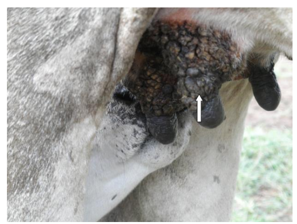
Plate I: A White Fulani cow affected by dermatophilosis. Note the thick, crusty and scabby lesions involving the udder and teats (arrow)