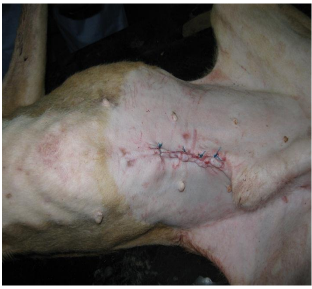
Plate III: Skin closure using interrupted horizontal mattress suture pattern

The case presented involved an eight-year-old Nigerian local dog. The dog had a good personality but was dehydrated, had abnormal dental wear and had impacted stomach. The above findings differ from earlier ones which associated aberrant appetite with