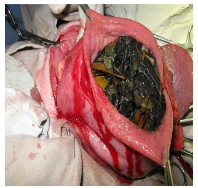
Plate II : Gastric incision exposing the gastric foreign Body, space between gastric and foreign