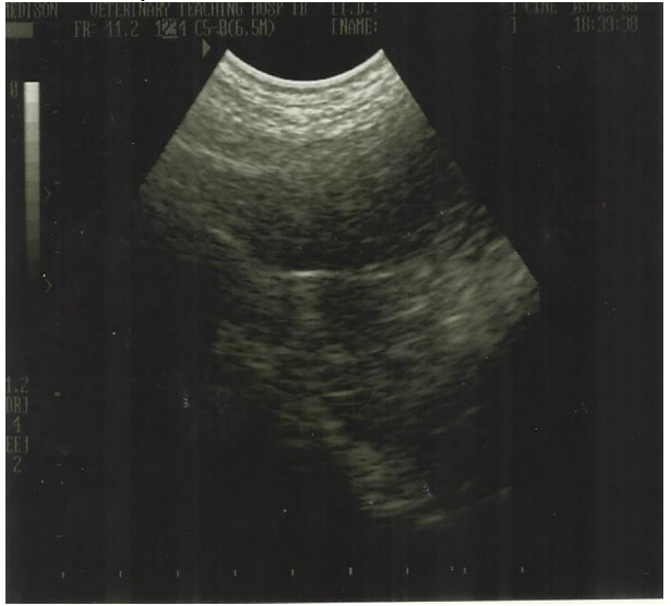
Plate IV : Ultrasound image of the uterus confirming the presence of foetuses

(Root-Kustritz, 2007). The misuse of oxytocin in terms of over-dosage by the clients probably must have contributed to the eventual birth of dead puppies after veterinary intervention (Chennels et al. , 2012).