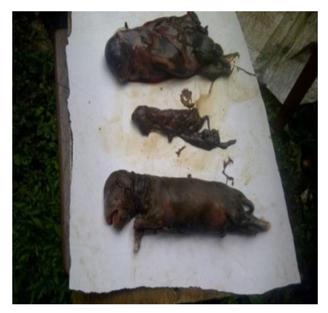
Plate II : Autolysed fetuses of different sizes and ages delivered by the bitch

The abnormality observed in the two cases at initial presentation was that of difficult and unduly prolonged labour (dystocia). More than 50 i.u of oxytocin had been administered in quick successions by the clients prior to presentation to the clinic in an attempt to manage the cases on their own but with no resultant outcome. This is contrary to the recommended and documented dosage in canine