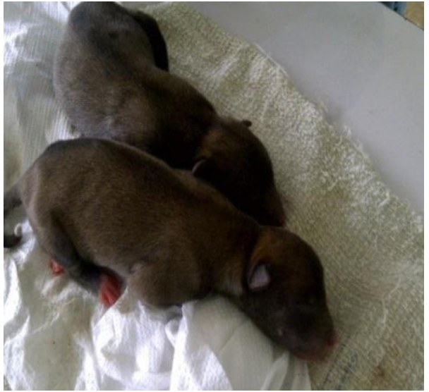
Plate III : Two live puppies delivered by the bitch after oxytocin administration